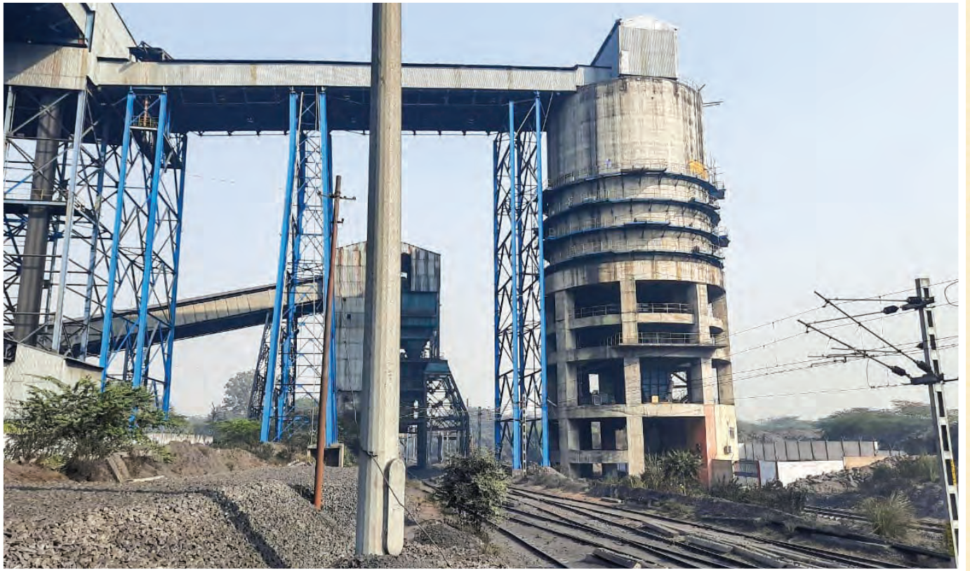
Commissioning of Krishna Shila Project by HEC in NCL