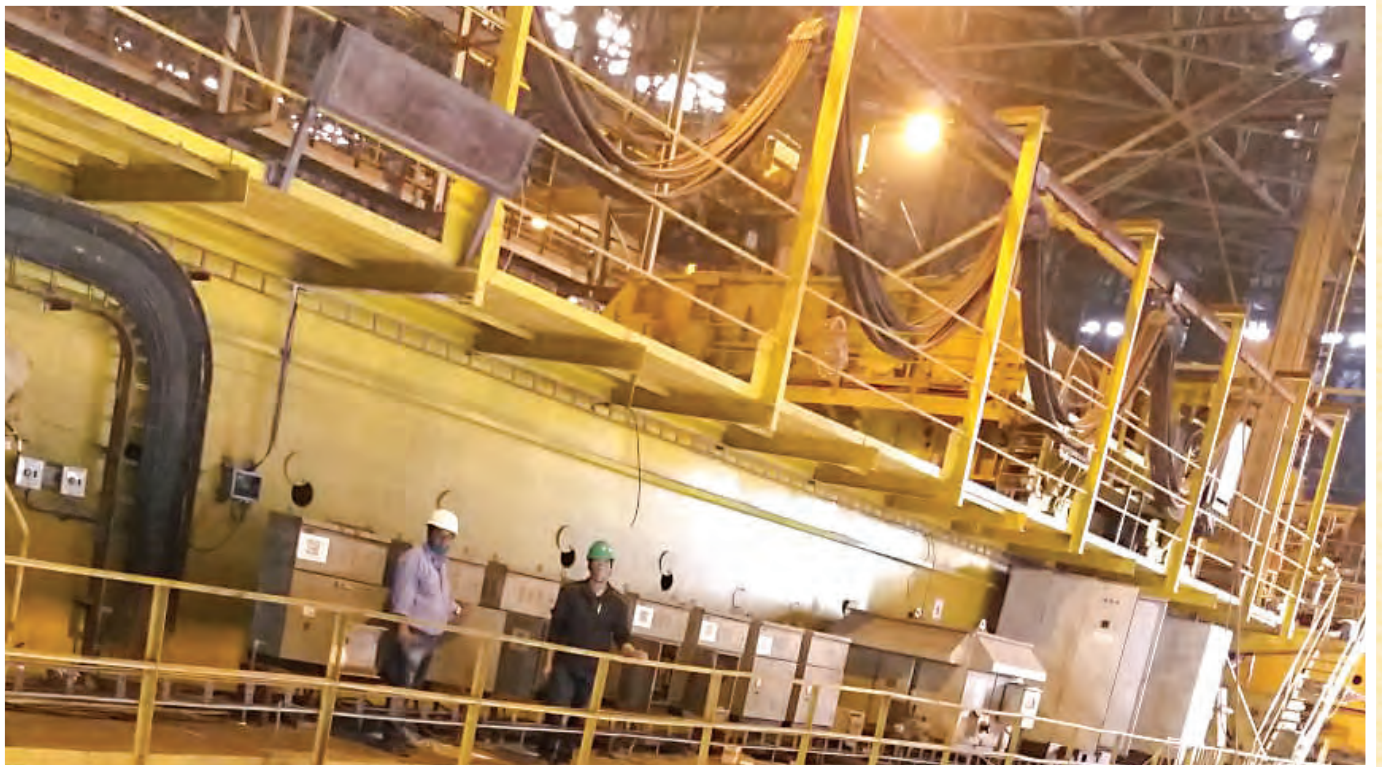
EOT Cranes supplied by HEC commissioned at Bhilai Steel Plant