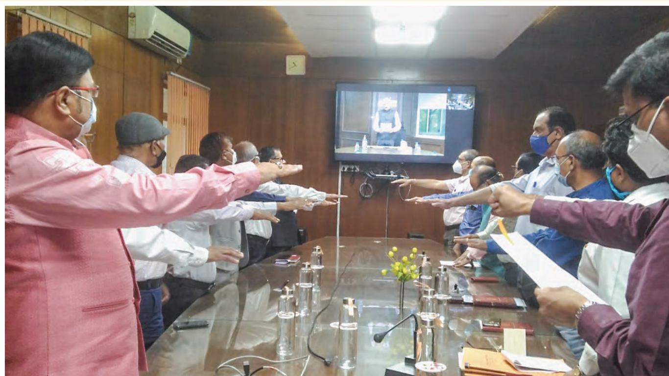
CMD administering Oath through VC during Vigilance Awareness Week