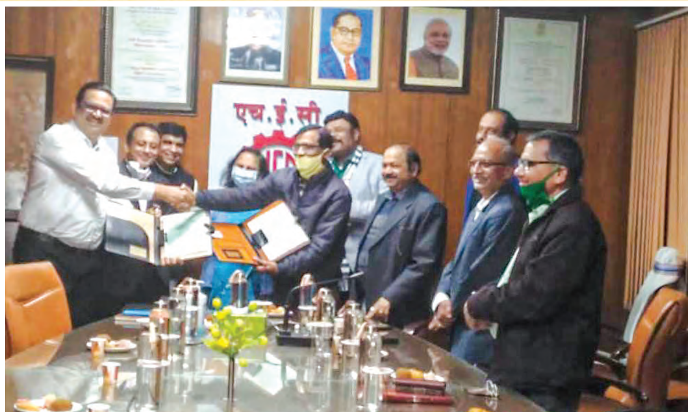
Agreement between HEC & EESL