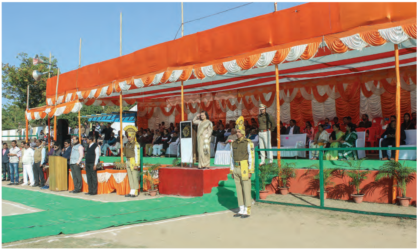
Republic Day Celebration in HEC